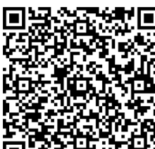
Clubs & Organizations