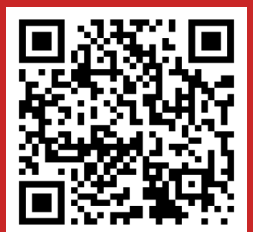
Student Info SP