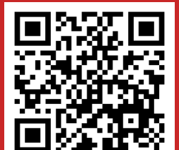
Dine on Campus